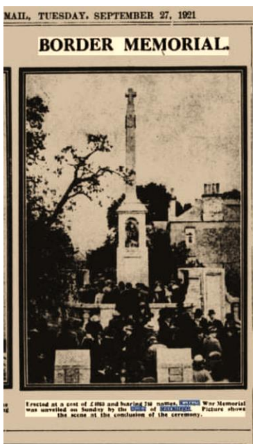
Image copied from Kelso Mail 27 th September 1921