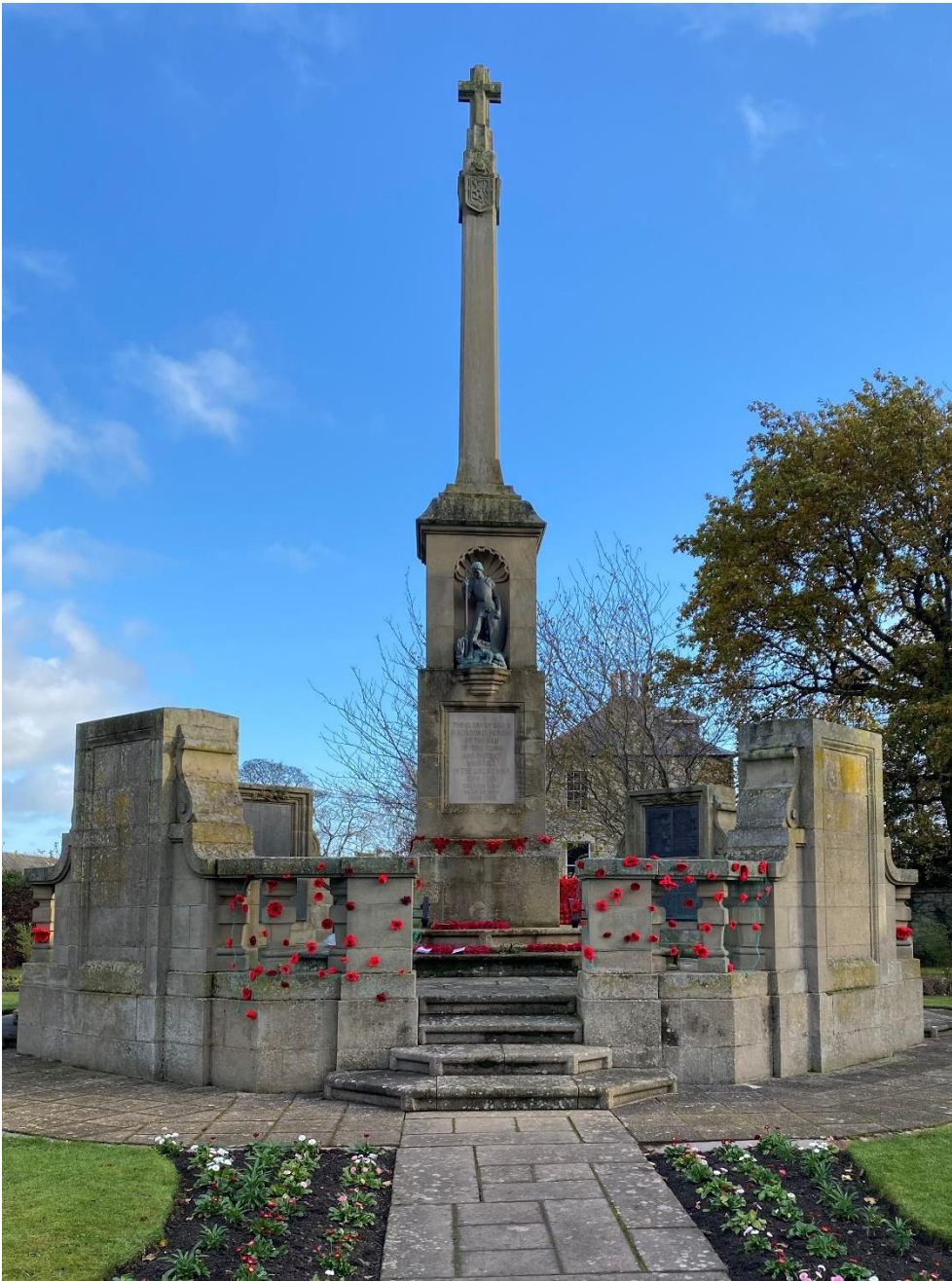
Kelso War Memorial November 2020

100 years ago – Kelso War Memorial was designed by Sir Robert Lorimer in 1921 and unveiled in September of that year.